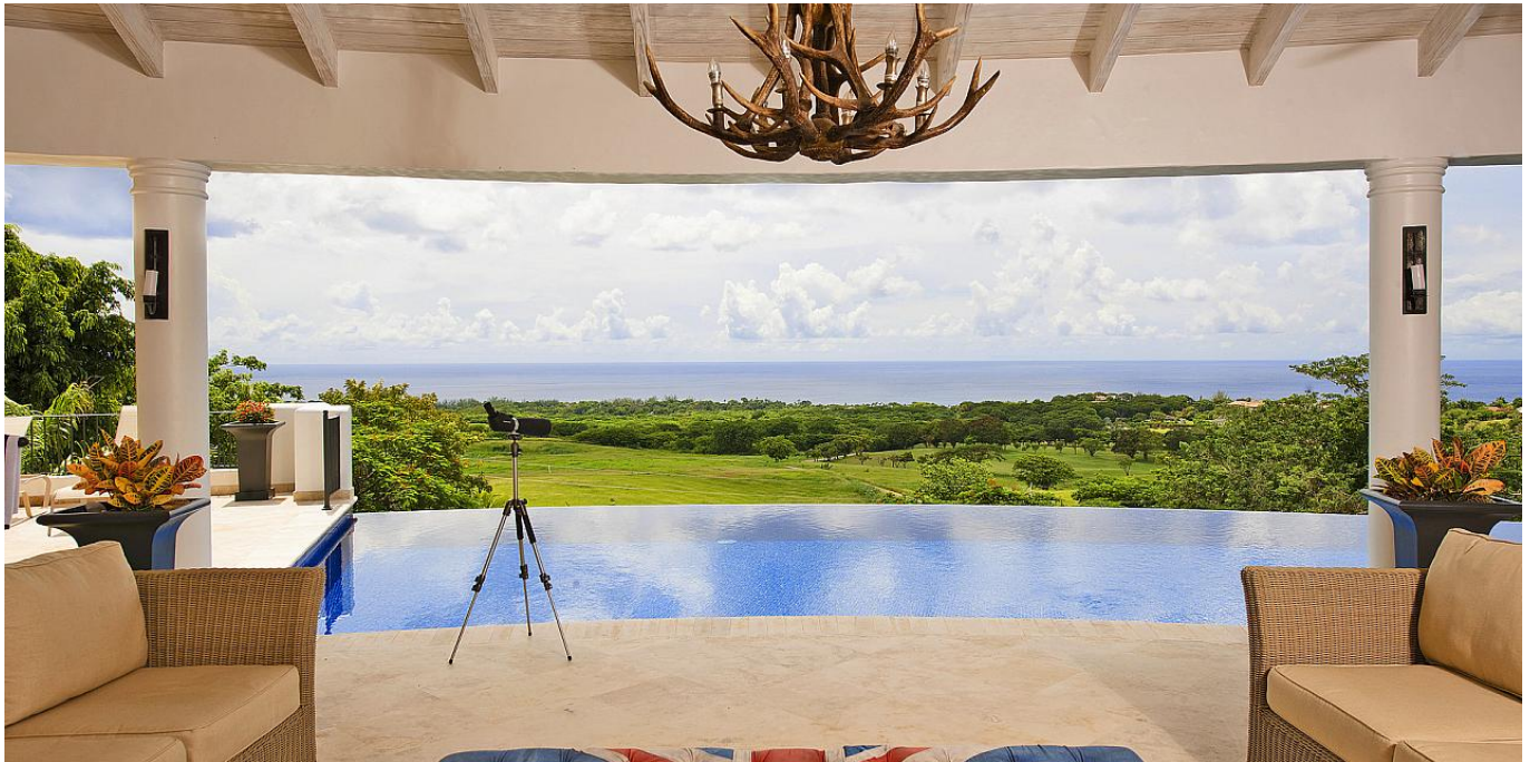
MARTELLO HOUSE , 6 - 8 BEDROOMS , 8 BATHROOMS