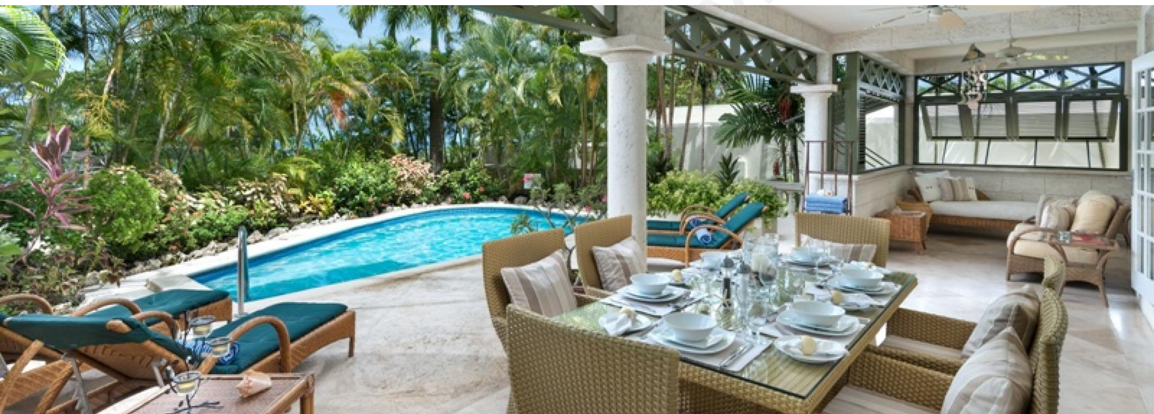
EMERALD PEARL AT SUMMERLAND VILLAS , 3 BEDROOMS